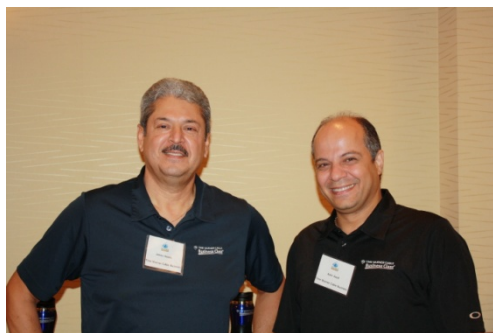
Time Warner Cable