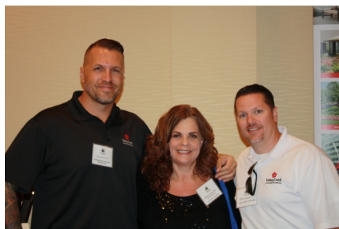
ValleyCrest Landscaping and MCA Realty