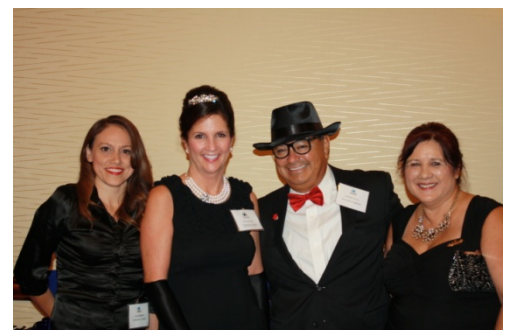
Executive Lighting and Proficiency Capital